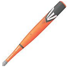
$20 Easton Mako